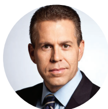
Gilad Erdan Minister of Strategic Affairs & Public Diplomacy