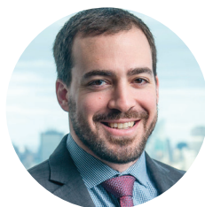
Sam Block ESG Research MSCI