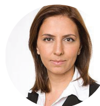
Gila Gamliel Minister for Social Equality